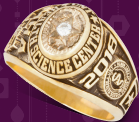
P100S - Century