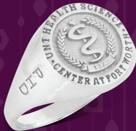
C1000S - Lincoln

Herff Jones takes pride in creating college graduation rings for students and graduates of University of North Texas Health Science Center .