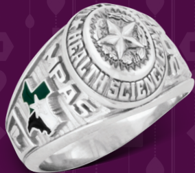
P100S - Century