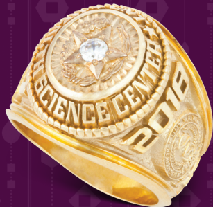
P300X - Collegiate