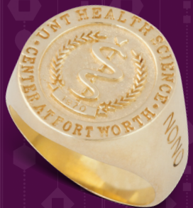
C1000X - Lincoln