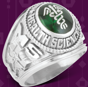
P300X - Collegiate