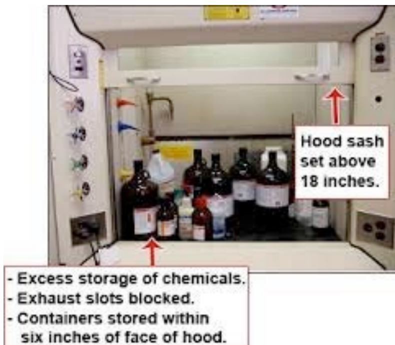
Figure 2. An Overcrowded Fume Hood

EHS surveyors will conduct annual fume hood monitoring, which will include but is not limited to: works surface and storage assessments and sash air velocity measurements. If the fume hood is functioning (i.e., proper face velocity is achieved) and the work surface and storage are properly maintained, EH&S will place a sticker on the side of the fume hood. This sticker will list the date the fume hood was tested and will indicate the sash height that provides a face velocity between 60-150 linear feet per minute.