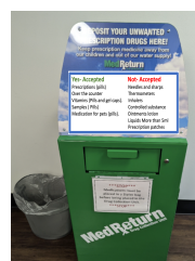
Figure 3 - Drug collection drop box