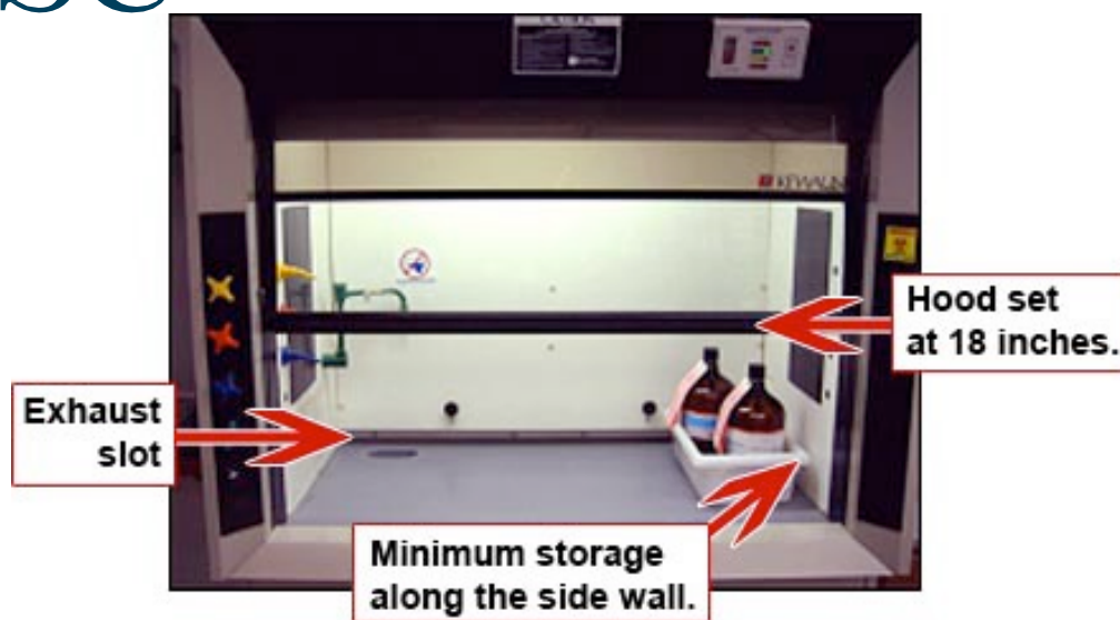
Figure 1. Properly maintained Fume Hood