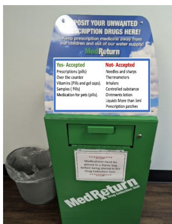
Figure 3. Drug Collection Dropbox

Expired and unused prescription drugs should be packed in a zip lock bag and taken to the drug collection drop box located at UNTHSC police department or to the pharmacy on the 3 rd floor of HP.