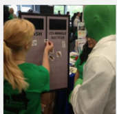
Earth Day Event 2013.....1