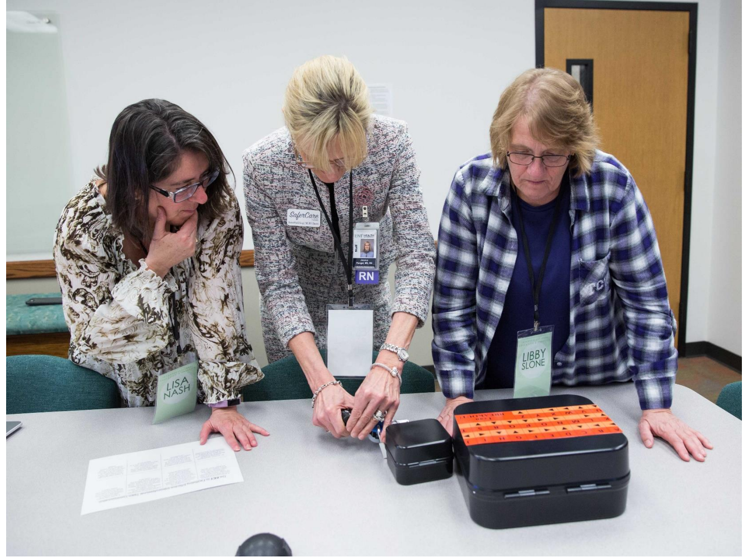
(Photo credit: Jill Johnson. Faculty apply teamwork strategies to play the IP Escape room game.)

Therefore, it is imperative faculty are equipped to provide interprofessional education in the classroom and authentic examples of interprofessional practice in clinical settings. To be effective faculty must develop the appropriate knowledge, attitudes and skills associated with core competencies around the values and ethics, roles and responsibilities, communication and teamwork needed for successful interprofessional collaboration. Development of Innovative strategies to overcome professional silos and barriers to effective interprofessional teamwork will help faculty more fully engage learners and integrate IPE into their courses.