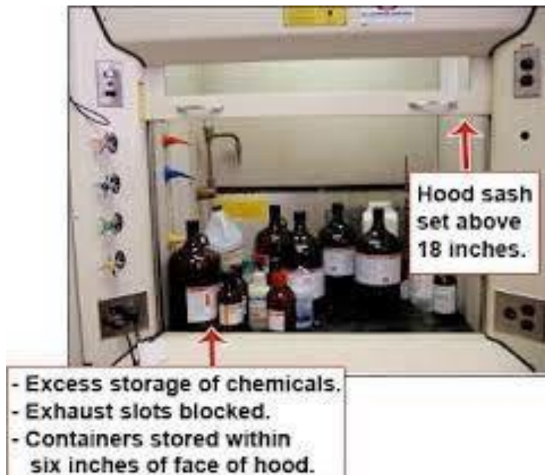
Figure 2. An Overcrowded Fume Hood

EHS will conduct annual fume hood certifications, which will include but is not limited to: work surface and storage assessments and sash air velocity measurements.