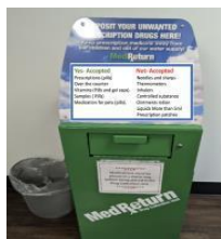
Figure 3 - Drug collection drop box

UNT Health in collaboration with the DEA participates in the collection of personal prescription drugs. Personal expired and unused prescription drugs should be packed in a zip lock bag and taken to the drug collection drop box located at UNT Health police department.