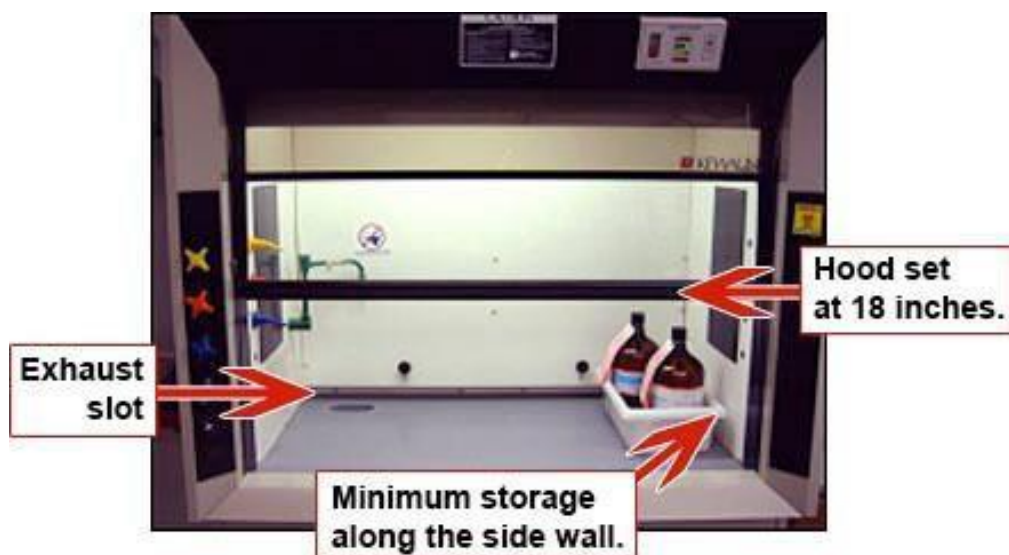
Figure 1. Properly maintained Fume

Chemical fume hoods (i.e., fume hoods) are the most important engineer control used to protect laboratory personnel from exposure to hazardous chemicals and agents (Figures 1 & 2). All operations involving the use of hazardous chemicals must be conducted within a chemical fume hood.